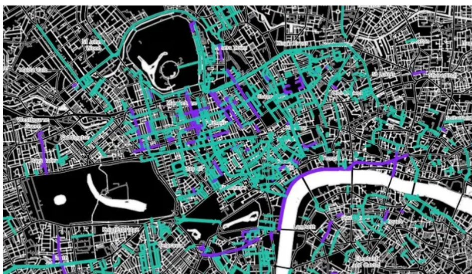
...whereas in London, streets named after people are 60% male and 40% female

Other trends that the streetonomics team observed included changes in the types of professions venerated. Certain jobs have been consistently celebrated over the centuries, such as artists and writers – particularly so in Paris and Vienna – but others have gone out of fashion, such as military leaders. In recent decades, London has begun to name more streets after people in the creative sector than one its previous favourite sources: the Royal Family. And in New York, most of the named streets come from the "business and community" sector, such as civil servants, or emergency responders involved in the 2001 attacks.