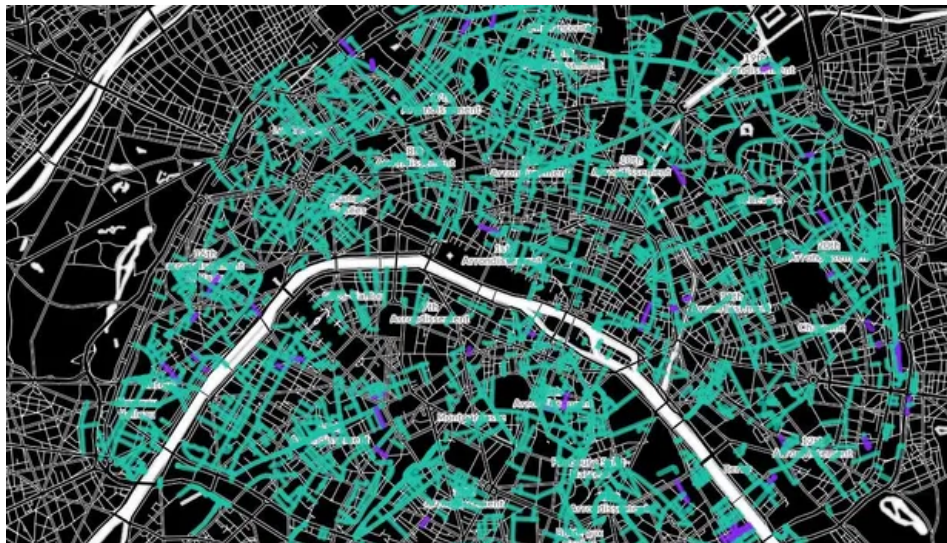
Of person-titled streets in Paris, male names (green) are more common than female (purple)