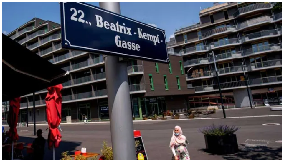
A street in a suburb of Vienna, one of the cities that the "streetonomics" team studied

inspiration came from some of their previous work, which BBC Future first covered back in 2013 , where they attempted to measure aspects of a city not captured by the usual economic indicators, such as how people attach emotions and memories to certain places. They were also inspired by the study of " culturomics ", which attempts to study previously unquantifiable facets of human culture.